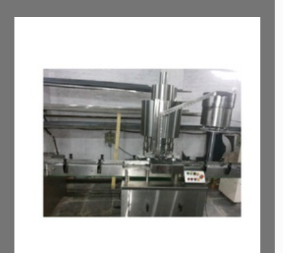
Screw Capping Machine Single Head