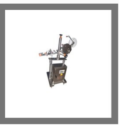
Table Top Labeling Machine