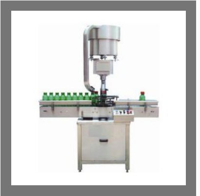
Screw Capping Machine