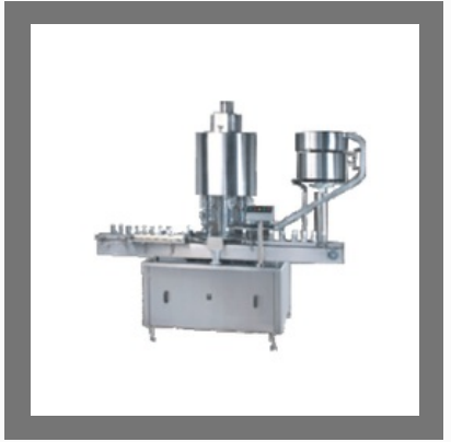
Automatic Screw Capping Machine