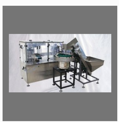
Single Hopper Single Head Wad Inserting Machine