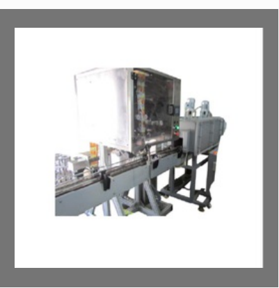
Shrink Wrapping Machine