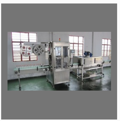
Automatic Double Side Sticker Labeling Machine