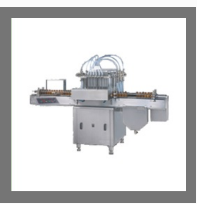
Liquid Filling Machine