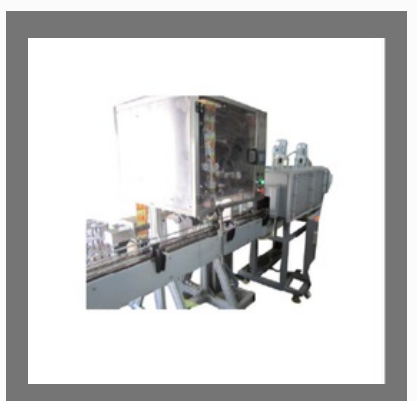
Automatic Shrink Sleeve Applicator Machine with Shrink Tunnel