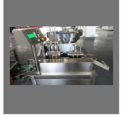
Double Hopper Double Head Wad Inserting Machine