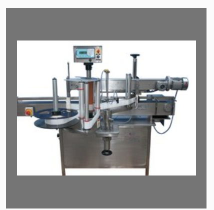
Front Side Labeling Machine