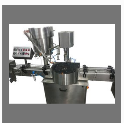
Screw Capping Machine Multi Head