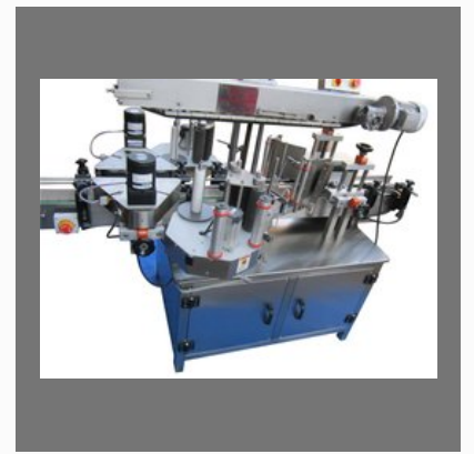
Front And Back Labeling Machine