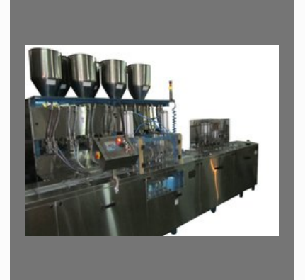
Powder Filling Machine