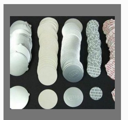
Induction Wads for Plastic Bottles