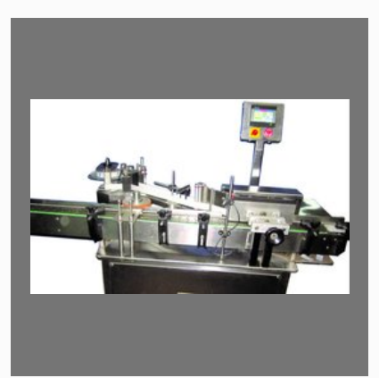
Wrap Around Labeling Machine