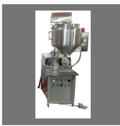
Hopper Piston Filling Machine