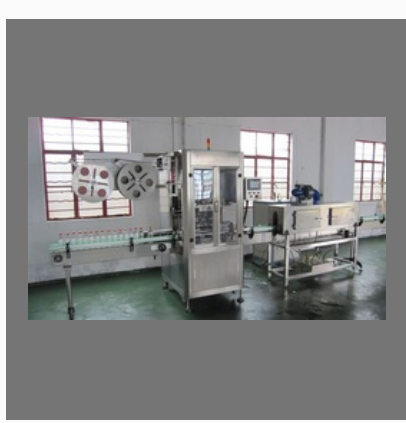
Automatic Shrink Sleeve Labelling Machine (Applicator)