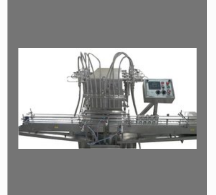
Volumetric Liquid Filling Machine