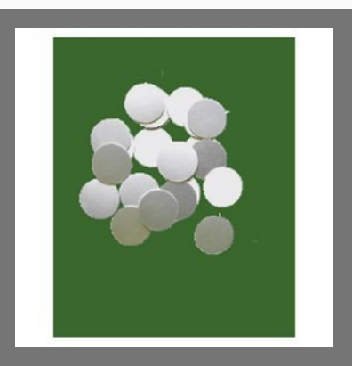
Induction Wads For Glass Bottles